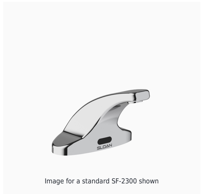
Image for a standard SF-2300 shown