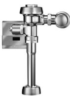
ROYAL 180 ES-S

For "L" Dimension longer than 12-3/4", add 5.30 per inch.