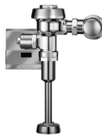
ROYAL 186 ES-S