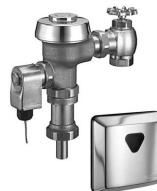
ROYAL 194 ES-SM