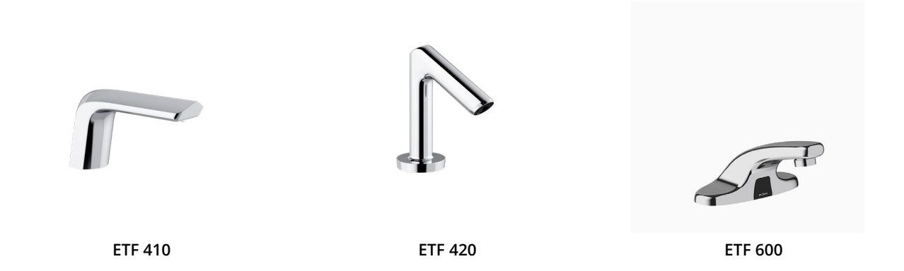
Table 1. Sloan Optima ETF sensor faucet models represented in this EPD.

A faucet is a fitting designed for discharge of a specific volume of water into a lavatory that is turned on mechanically or electronically, and intended to be installed in non-residential bathrooms that are exposed to walk-in traffic. The volume or cycle duration can be fixed or adjustable. Lavatory faucets are used primarily for hand washing or simple rinsing. Optima<sup>®</sup> faucets feature a cast brass spout, quick connect fittings, infrared sensors and integrated water shut-off. The product systems under study include the following products.