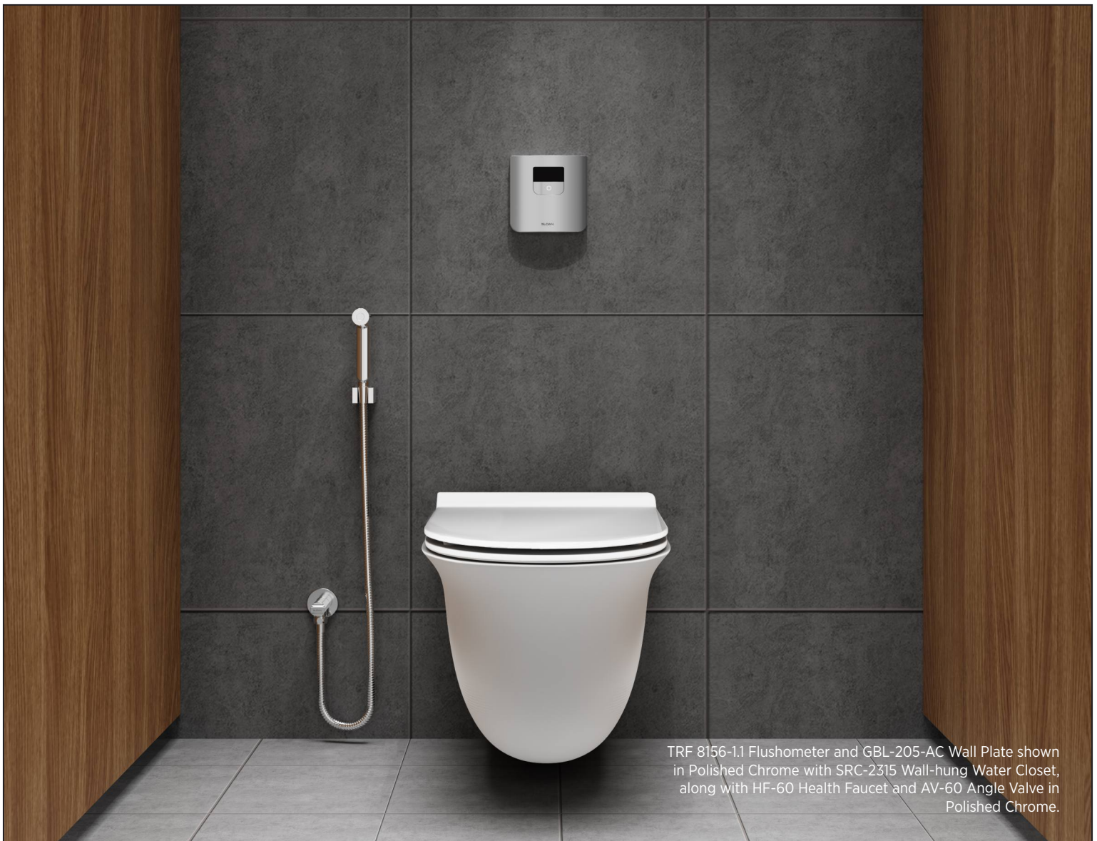
TRF 8156-1.1 Flushometer and GBL-205-AC Wall Plate shown in Polished Chrome with SRC-2315 Wall-hung Water Closet, along with HF-60 Health Faucet and AV-60 Angle Valve in Polished Chrome.