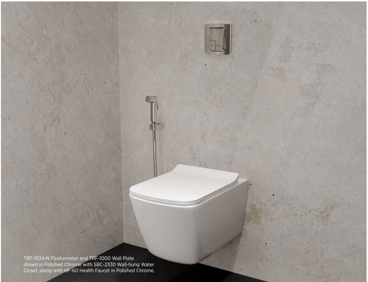
TRF-1024-N Flushometer and TRF-1000 Wall Plate shown in Polished Chrome with SBC-2330 Wall-hung Water Closet, along with HF-60 Health Faucet in Polished Chrome.