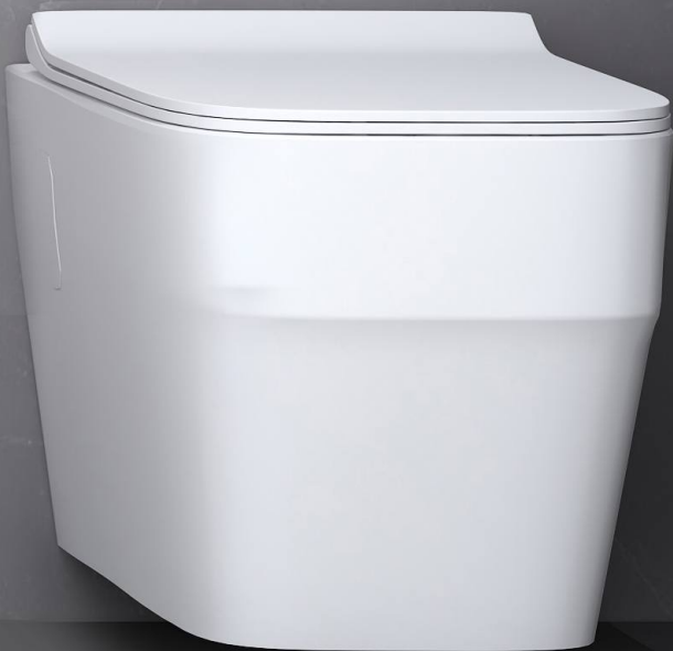
TRF 1024-N Flushometer and TRF 1000 Wall Plate shown in Polished Chrome with SRC-2310 Wall-hung Water Closet.