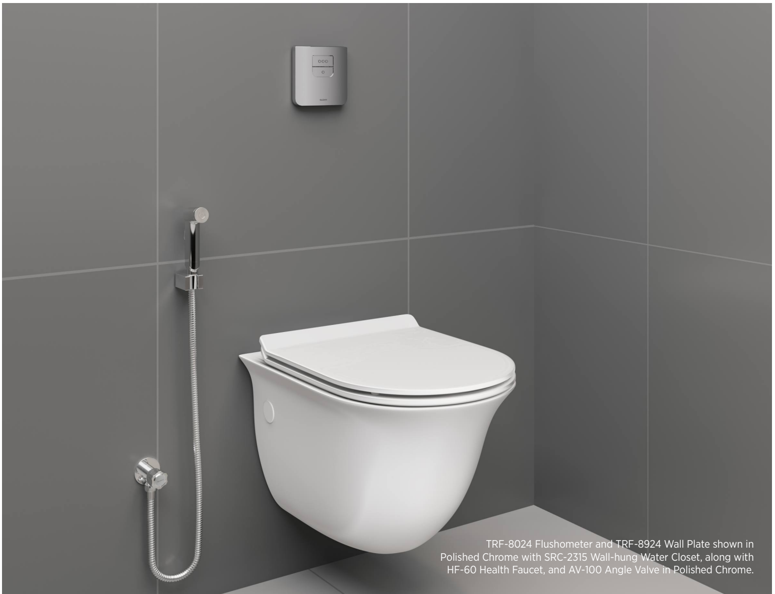
TRF-8024 Flushometer and TRF-8924 Wall Plate shown in Polished Chrome with SRC-2315 Wall-hung Water Closet, along with HF-60 Health Faucet, and AV-100 Angle Valve in Polished Chrome.