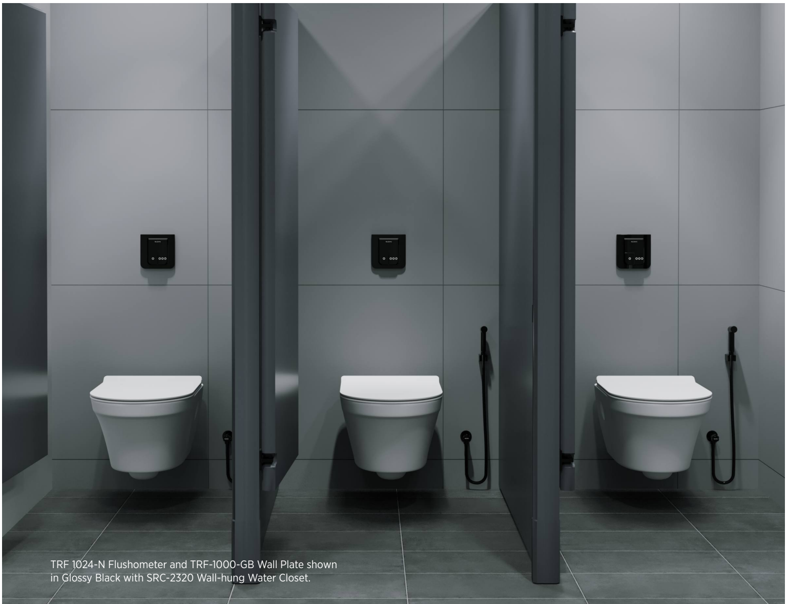
TRF 1024-N Flushometer and TRF-1000-GB Wall Plate shown in Glossy Black with SRC-2320 Wall-hung Water Closet.