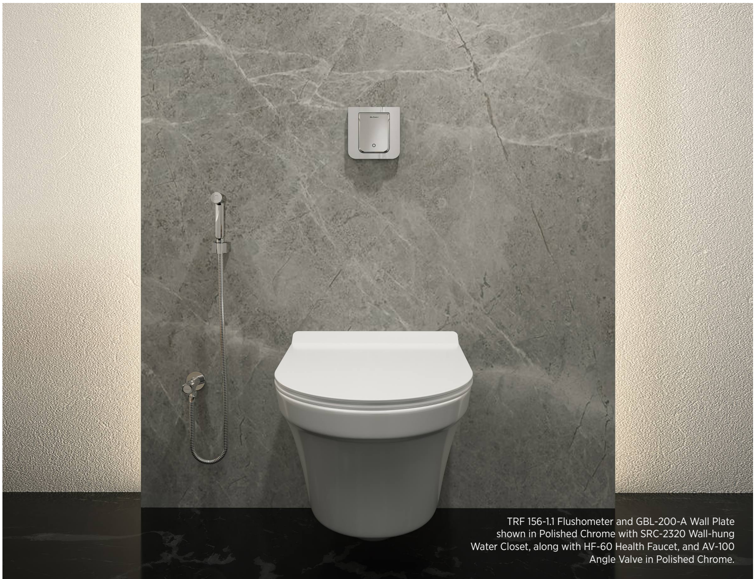
TRF 156-1.1 Flushometer and GBL-200-A Wall Plate shown in Polished Chrome with SRC-2320 Wall-hung Water Closet, along with HF-60 Health Faucet, and AV-100 Angle Valve in Polished Chrome.