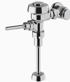
Variation Not Shown: Ground Joint